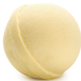
BS205—Bath Bomb 150g; 7,95$

Shampoo. Moisturizing therapy to help dry scalp, eczema and psoriasis. Soothes and softens the scalp. Nourishing shampoo for very dry hair. Helps relieve eczema and psoriasis of the scalp. Unscented.