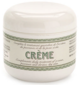
Dry Skin Cream CR100— 16g; 9,95$ CR101—65g; 28,95$ CR102—130g; 38,95$

Shower gel, helps hydrate skin and normalize production of natural lubricants. Gentle enough for extremely sensitive skin. Unscented.