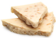
FC030—Jasmin and Oats Soap 115g; 7,95$

Mild, deodorant, hypoallergenic soap for body, face and hair. Astringent, emollient and outdoor energizer. For all types of skin.