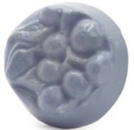
WV041—Blueberry Soap 115g; 7,95$

Mild, fun, hypoallergenic face and body soap. Invigorates the skin and makes your bathroom smell like tropical juicy oranges. For normal skin.