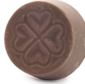
HM060—Oak Soap 130g; 7,95$

Mild, fun, hypoallergenic face and body soap. Invigorates the skin and makes your bathroom smell like cool spring lilacs. For normal skin.