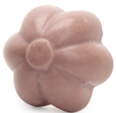
WV030—Raspberry Soap 70g; 4,95$

Mild, fun, hypoallergenic face and body soap. Invigorates the skin and makes your bathroom smell like green apples. For normal skin.