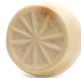
WV091—Orange Soap 120g; 7,95$

Enjoy jasmine & lavender uniting together to form this extra-rich lathering, hypoallergenic face and body soap. They are known for their relaxing properties. Made with love, here in Chelsea!