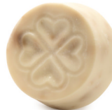
ST070—Citrus Mint Soap 130g; 7,95$

Activate your skin's vitality with our creamy, mild abrasive, spring fresh wheat. Ideal for combination skin.