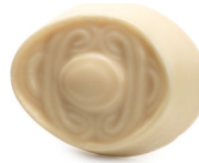
ST080—Her Soap 80g; 7,95$

Cleansing, mild exfoliating and soothing soft. Ideal for people with combination skin.