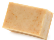
FC040—Fresh Wheat Soap 115g; 7,95$

The qualities of purity, honesty and integrity are prized by this St. Stephen candy manufacturer. Indulge your senses. This chocolate melts slowly on your body, not in your mouth. For hair, face and body.