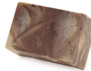
SA131—Ganong Chocolate Soap 115g; 7,95$

Exceptionally smooth, long-lasting, hypoallergenic face and body soap.