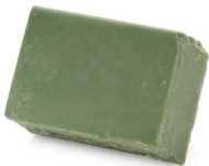
RX020—Honeysuckle Soap 115g; 6,95$

Smooth and silky. A fragrant summary of utter, ageless femininity.