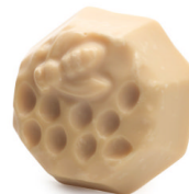
RX060—Honey Soap 70g; 5,95$

Mild, fun, hypoallergenic face and body soap. Invigorates the skin and makes your bathroom smell like fresh summer raspberries. For normal skin.