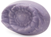
W061—Spring Lilac Soap 70g; 4,95$

Mild, fun, hypoallergenic face and body soap. Invigorates the skin and makes your bathroom smell like cool spring lilacs. For normal skin.