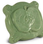
WV071—Green Apple Soap 150g; 7,95$

Mild, fun, hypoallergenic face and body soap. Invigorates the skin and makes your bathroom smell like fresh summer blueberries. For normal skin.